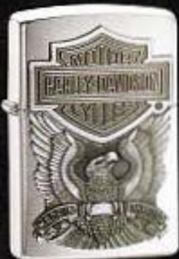
200HD H284 Made in USA 98 Brushed Chrome $32.95