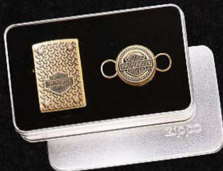
HD367 Diamond Plate Lighter/Key Holder Brushed Brass Gift Set $55.95