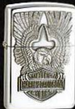
250HD H219 Soaring Eagle High Polish Chrome $33.95