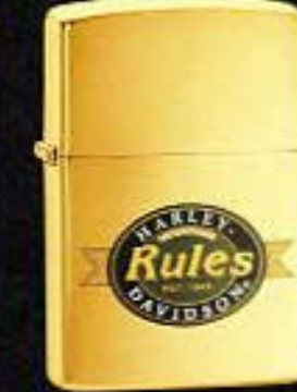
2048HD H582 H-D® Rules Brushed Brass $23.95