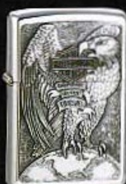
200HD H231 Made in USA Eagle Brushed Chrome $29.95