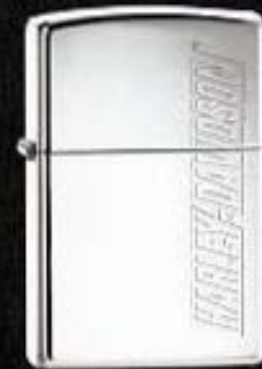
250HD H586 Harley-Davidson® High Polish Chrome $25.95