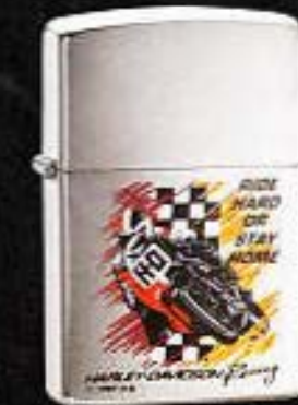
200HD H289 Ride Hard/Stay Home Brushed Chrome $21.95