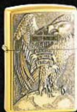
2048HD H229 Made in USA Eagle Brushed Brass $34.95