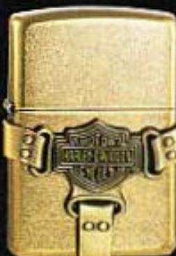
201FBHD H215 Bootstrap Emblem Antique Brass $38.95