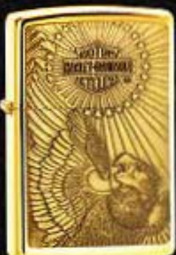
2548BSHD H147 Eagle Stars and Stripes High Polish Brass $35.95