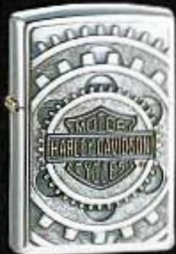
200HD H225 Gears Brushed Chrome $29.95