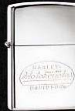
250HD H585 H-D® Motorcycle High Polish Chrome $21.95