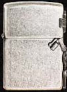
121FBHD H246 Handlebars and Shield Antique Silver Plate $53.95