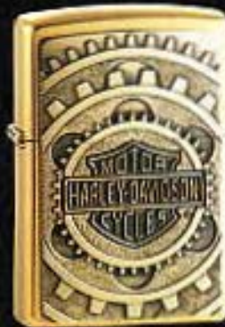
2048HD H223 Gears Brushed Brass $34.95