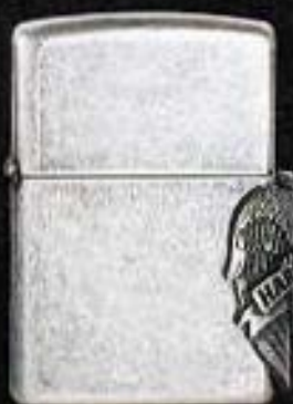
121FBHD H244 Eagle and Banner Antique Silver Plate $44.95