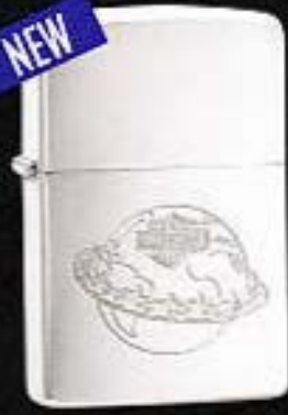
200HD H308 H-D® Globe Brushed Chrome $20.95