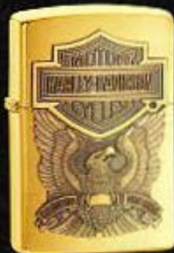
2048HD H283 Made in USA 98 Brushed Brass $36.95