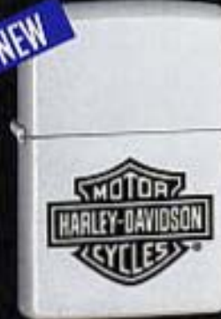
205HD H314 Bar and Shield™ Satin Chrome $20.95