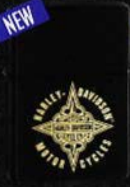
218HD H312 H-D® Diamond Black Matte $22.95