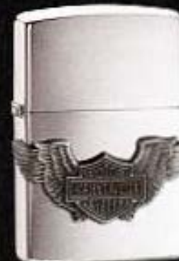
200HD H282 Shield/Wings Brushed Chrome $30.95