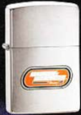
200HD H251 Harley Racing Orange Brushed Chrome $20.95