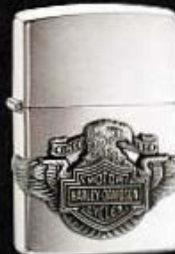
200HD H278 Since 1903 Brushed Chrome $31.95