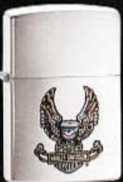
200HD H583 H-D® and Banner Brushed Chrome $19.95