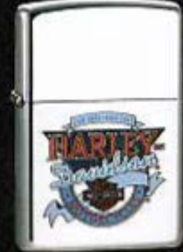
250HD H262 Live Free-Ride Free High Polish Chrome $28.95