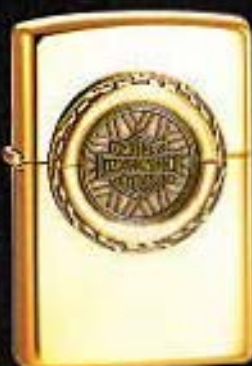
2548HD H249 Tire/Engine Surprise High Polish Brass $37.95