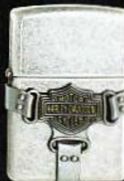
121FBHD H216 Bootstrap Emblem Antique Silver Plate $43.95