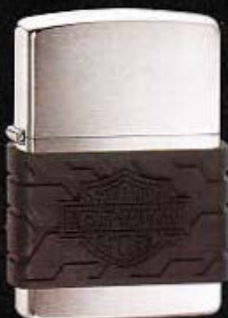
200HD H306 Harley Guard in oil filter can Brushed Chrome $31.95