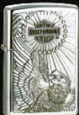
250BSHD H146 Eagle Stars and Stripes High Polish Chrome $33.95