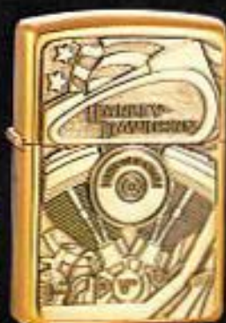
2548HD H247 Motor and Flag Surprise High Polish Brass $37.95