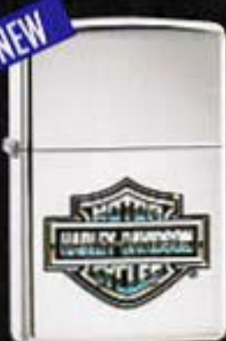
250HD H307 H-D® Patriotic High Polish Chrome $25.95