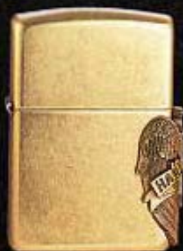
201FBHD H243 Eagle and Banner Antique Brass $41.95