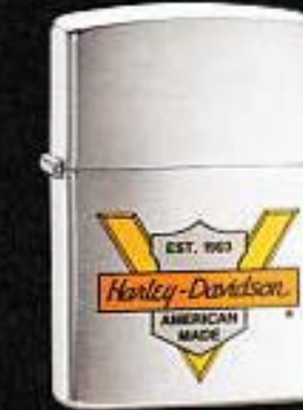
200HD H587 H-D® American Made Brushed Chrome $19.95