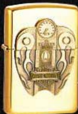
2548HD H266 Tank/Fuel Surprise High Polish Brass $37.95