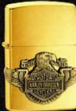
2048HD H277 Since 1903 Brushed Brass $37.95