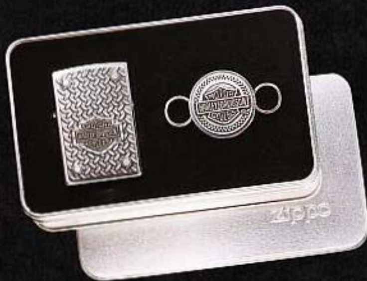
HD368 Diamond Plate Lighter/Key Holder Brushed Chrome Gift Set $49.95