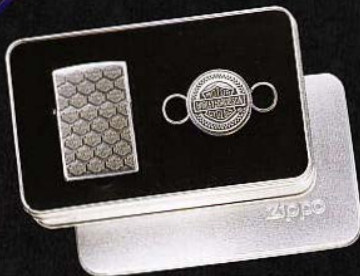
HD362 Multi Logo Lighter/Key Holder Brushed Chrome Gift Set $49.95