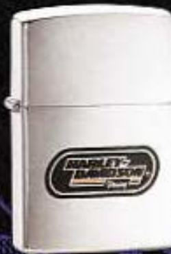
200HD H250 Harley Racing Black Brushed Chrome $20.95