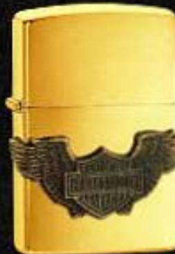
2048HD H281 Shield/Wings Brushed Brass $36.95