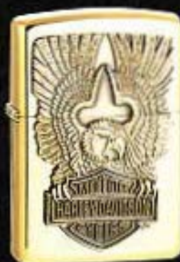
2548HD H217 Soaring Eagle High Polish Brass $35.95