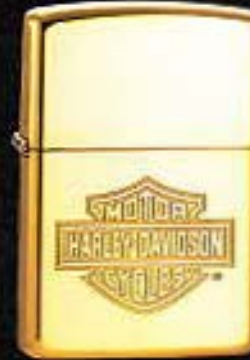
2548HD H260 Bar and Shield™ High Polish Brass $27.95