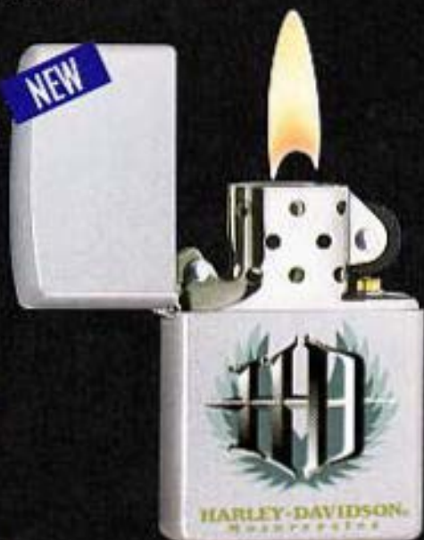
205HD H315 H-D® in Flames in oil filter can Satin Chrome $30.95