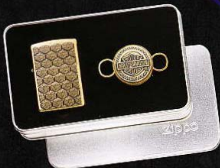
HD361 Multi Logo Lighter/Key Holder Brushed Brass Gift Set $55.95