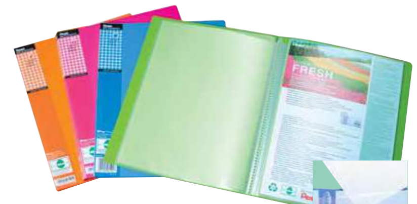
DCF542 20 pockets C F K P