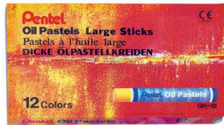
GHT-12, 24 & 48