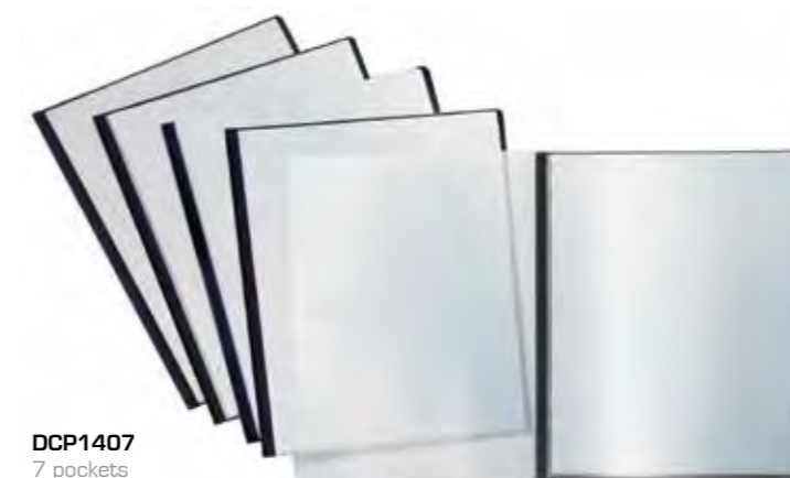
DCP1407 7 pockets A