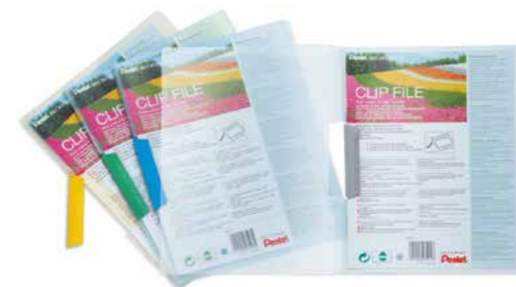
DCB14 C D G P T