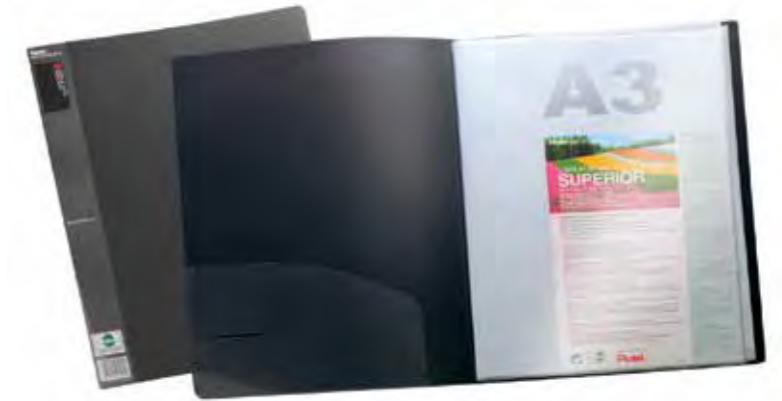
DCF132 20 pockets A