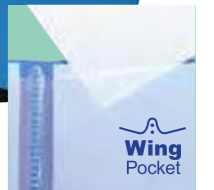
DCF444 40 pockets A B C