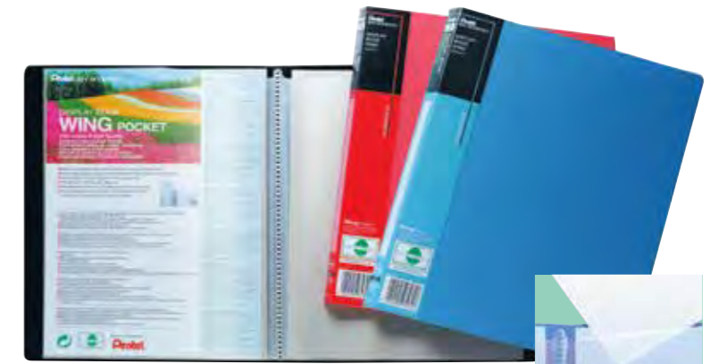
DCF442 20 pockets A B C