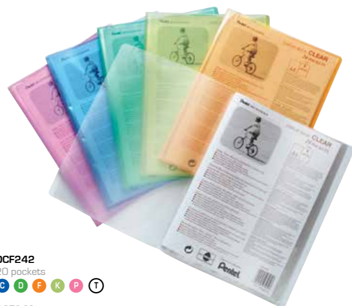
DCF242 20 pockets C D F K P T