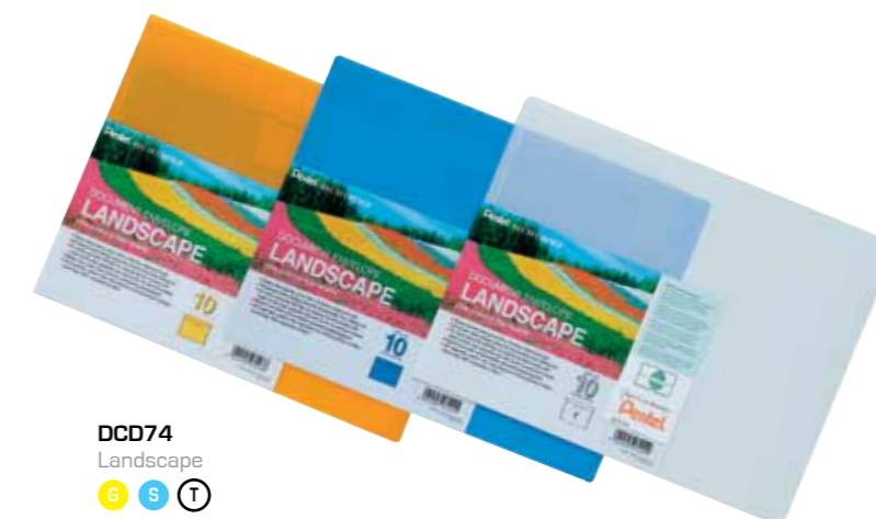
DCD74 Landscape G S T