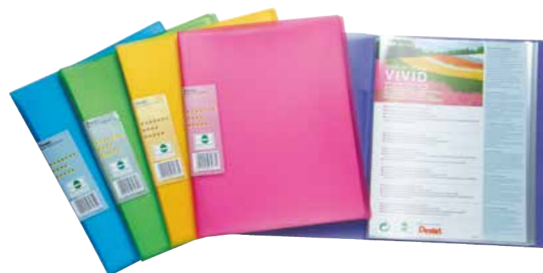
DCF343 30 pockets C D G P V