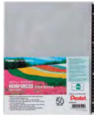
DCR2450T 50 pockets T