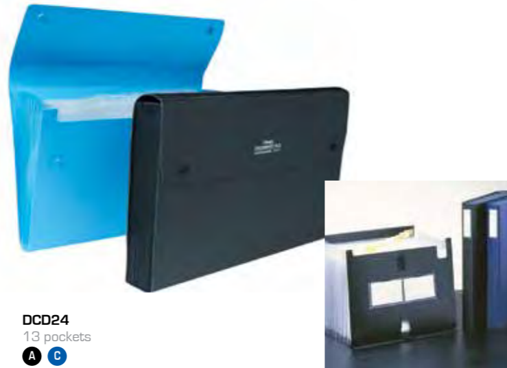
DCD24 13 pockets A C